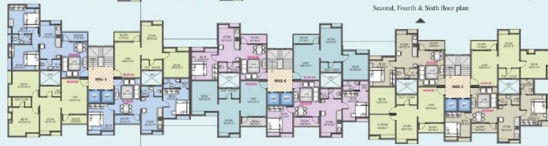
Second, Fourth & Sixth floor plan