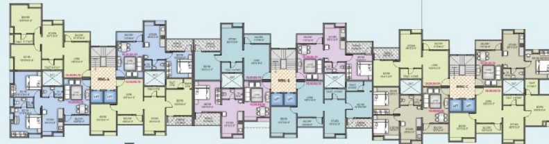
First, Third, Fifth & Seventh floor plan