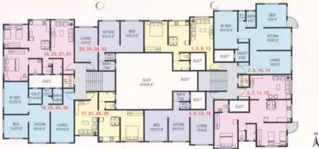
Typical Floor Plan (Still / First / Second / Third)