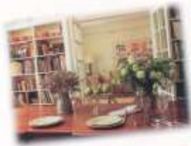
"BORA RESIDENCY" WITH LUXURY