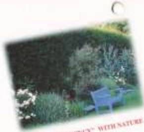
"BOBA RESIDENCY" WITH NATURE